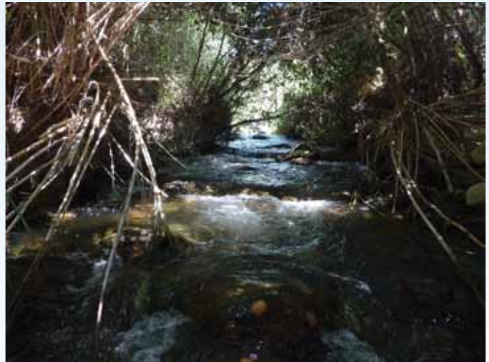
4. CROSS FLOW — These cross-river causeways pour fast moving water over large rocks and then reform the main channel below.