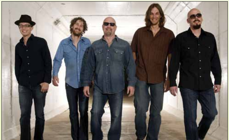
THE FABULOUS THUNDERBIRDS

are available only on the Conservancy’s website.