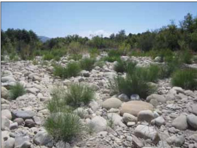
5. STONE FIELD — A large stone or cobble field comprises the main center section of the property, obviously flooded during high water.