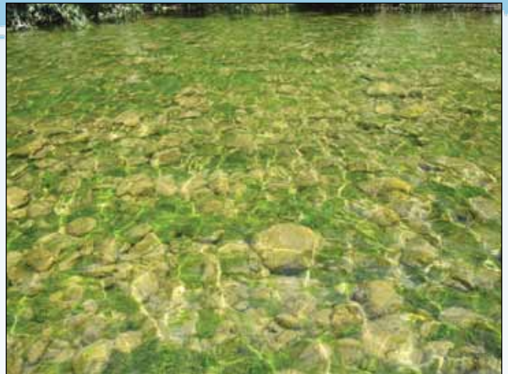
2. STONY BOTTOM — Swept-clean river rocks seem placed as smoothed pavers on the bottom.