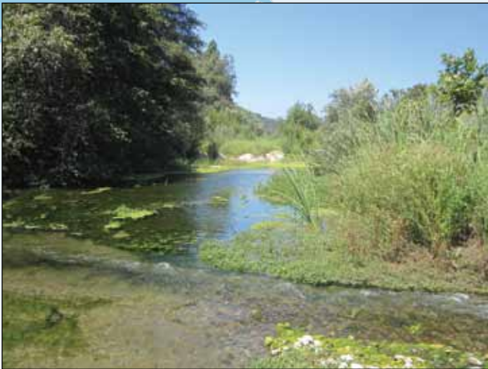
3. CROSS-FLOW AND CHANNEL — A side flow cuts straight across a smaller channel and sluices it to a larger channel below.

These features can be seen quite distinctly on close-up maps on Google Earth. The top of the wastewater plant is a good marker for locating its south edge. The accompanying photos depict some of these riparian features.