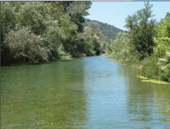
1. BROAD UPPER CHANNEL — This wide channel near the north top of the property — the deepest part here about 4 feet — is walled with curtains of dense brush and tree growth on either side.

At the upper portion of the property, the river flows south in one broad channel, about four feet deep and thirty feet