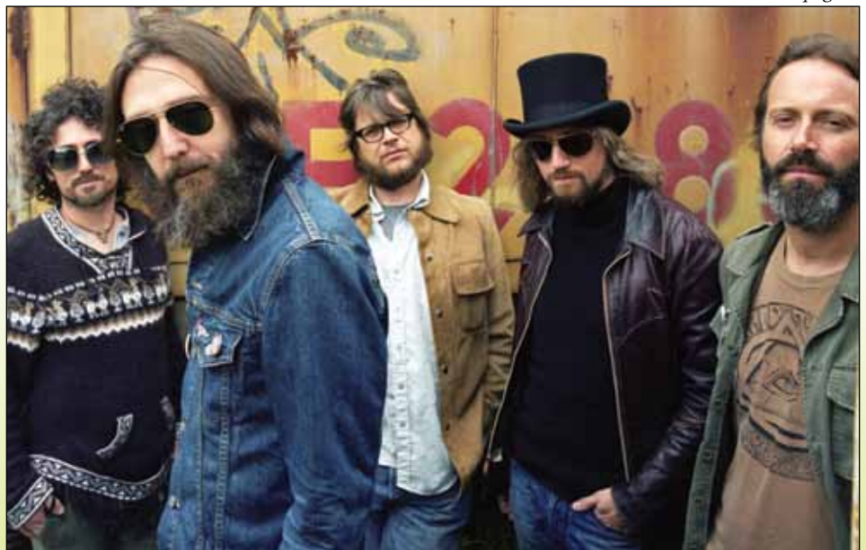
CHRIS ROBINSON BROTHERHOOD