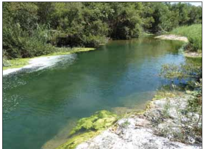
8. DEEP POOL — A deep green pool—about 8 feet deep in center—edged with rock marks the south terminus of the property.