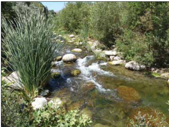
7. CASCADE — Waters coming together from the fragmented center section of the river rush down together to form an elegant cascade.