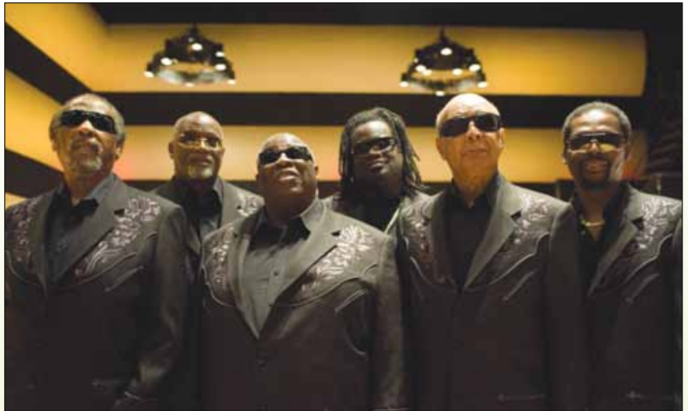
BLIND BOYS OF ALABAMA