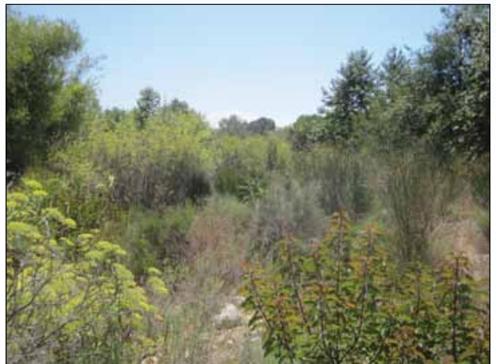
6. VEGETATION — Dry riparian vegetation covers some of the hot exposed stone field.